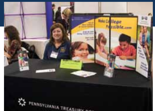
Many state and local agencies will be on hand to answer your questions about the programs and services available in our community.