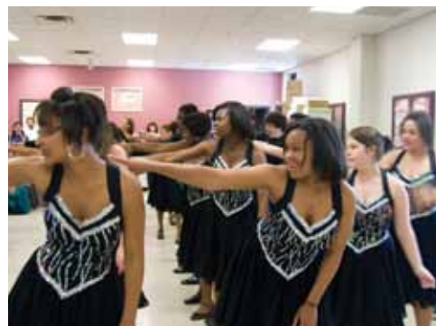
Students with the Pottstown High School Show Choir always wow the crowd with their singing and dancing talents. They will perform again this year during lunch.