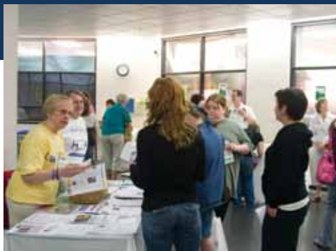
The annual Healthy Lifestyles EXPO always draws a crowd, and we have had to expand the space for the event over the years. I welcome you to attend the EXPO to learn more about the health care programs and local and state resources available.