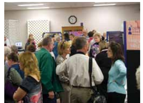
Don't miss out on this fun and informative event. Hundreds of people will attend, and I invite you to join them in learning more about how to live a healthier lifestyle.