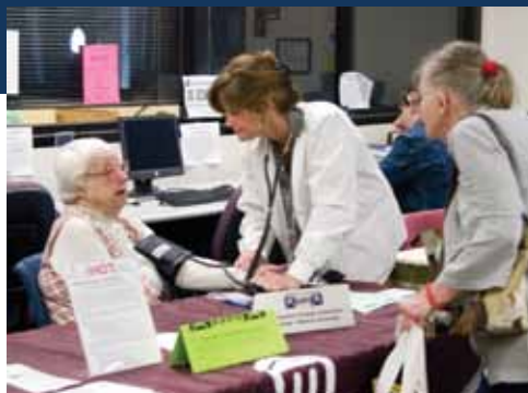
Health screenings, performed by the nursing students of the Montgomery County Community College, are always a popular draw of the Healthy Lifestyles EXPO.