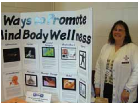
Along with traditional health programs, you can also explore alternative wellness information at the Healthy Lifestyles EXPO.